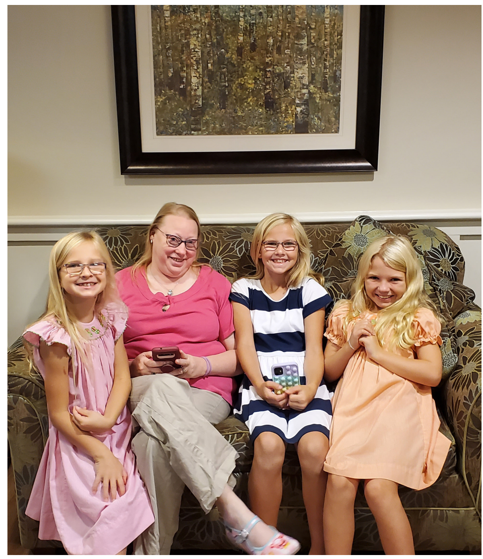
I meet new people.