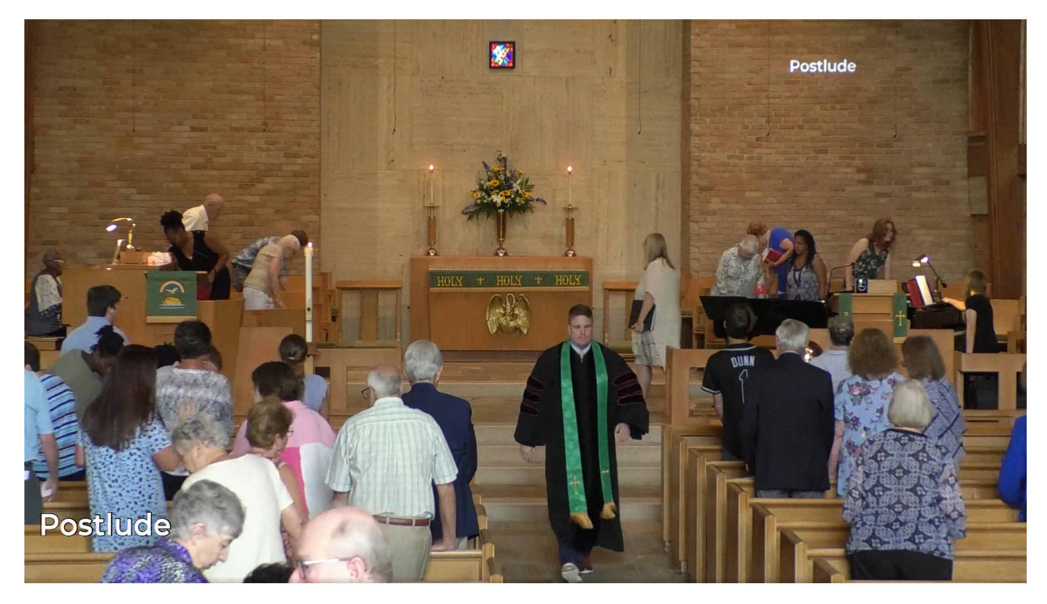
When the Pastor leaves, the service is over.