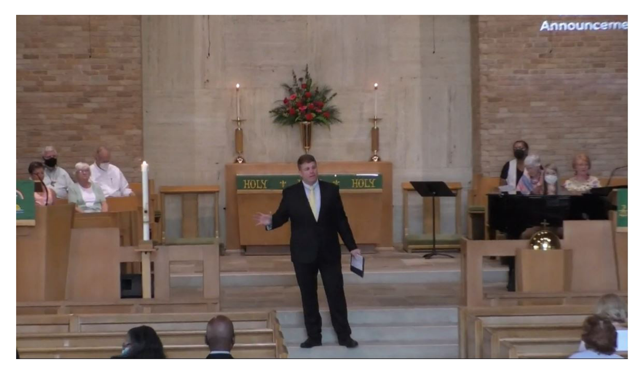
I listen to what the Pastor says.