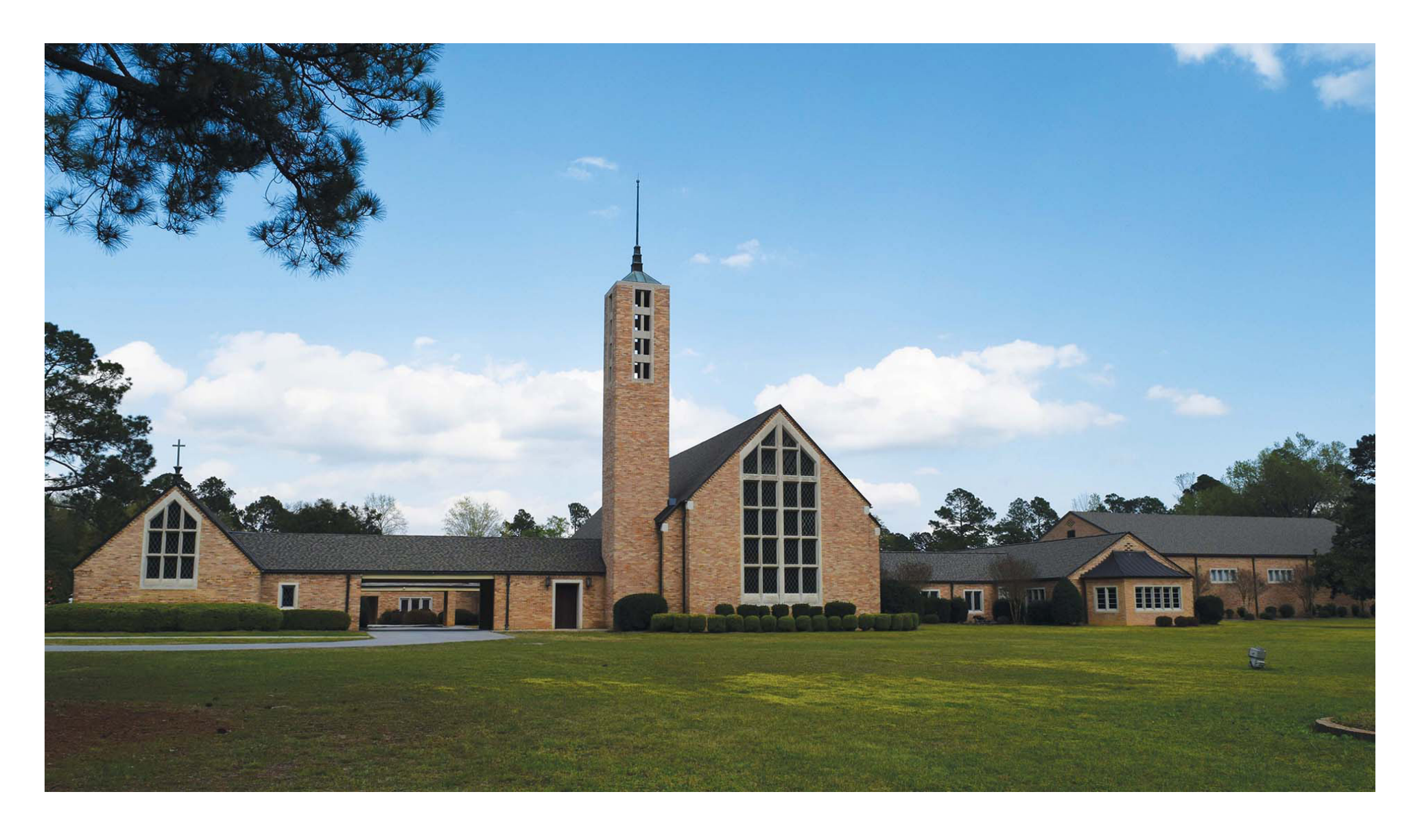
What happens at Pittman Park Church?