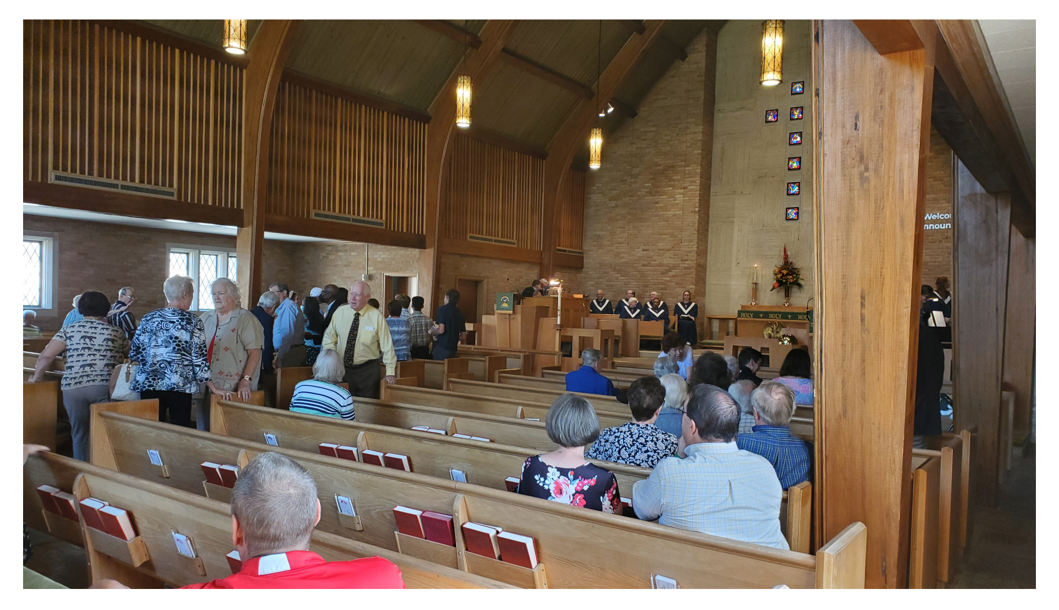
At the Traditional Service, I sit on a bench.