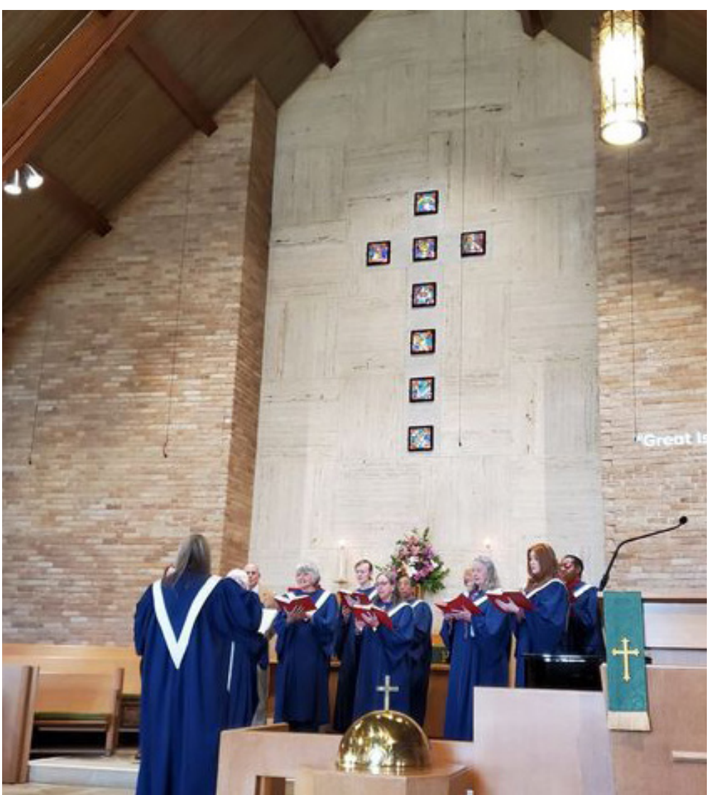
I sing and pray with the other people.