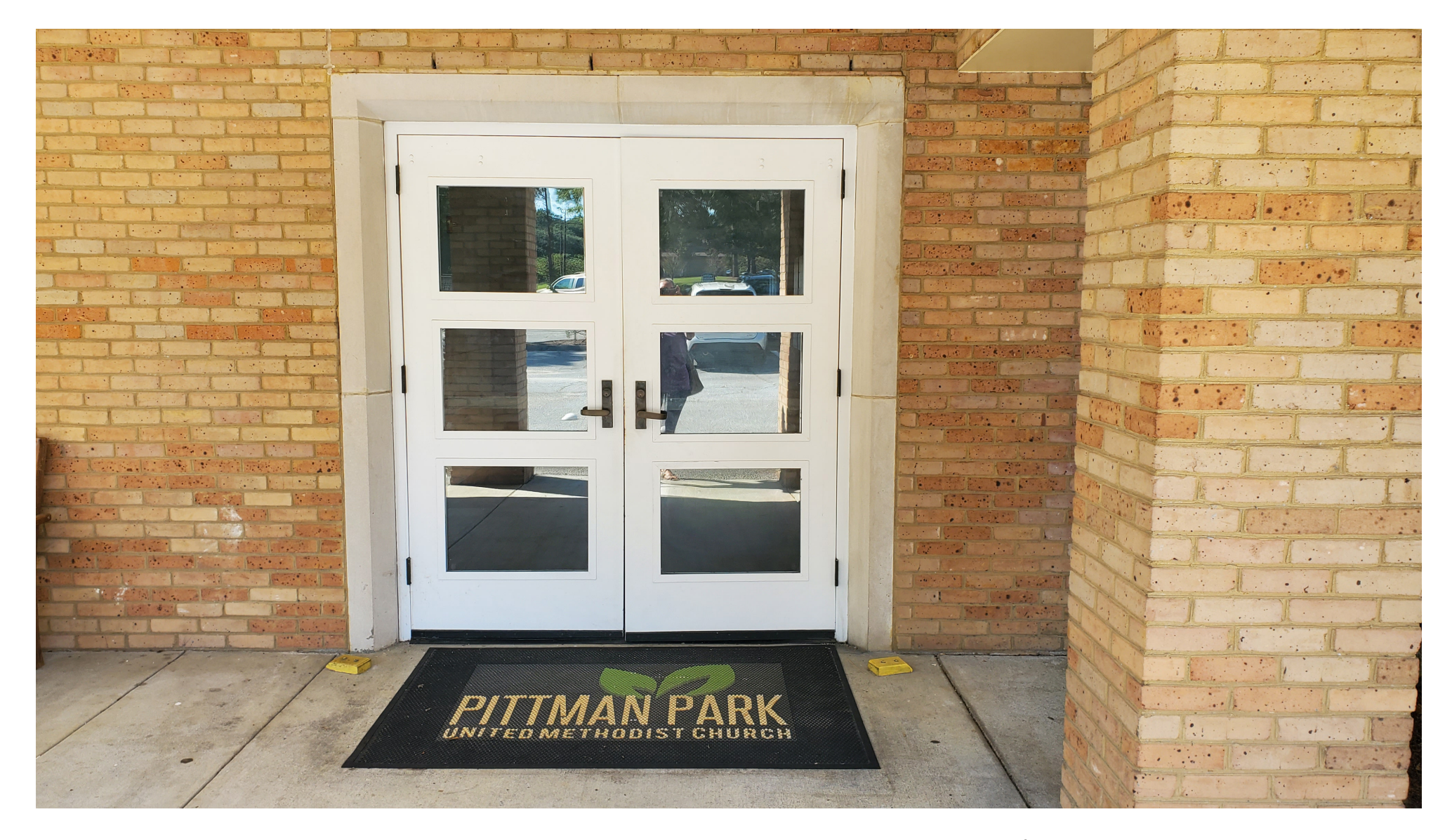
I go to Pittman Park Church with my family to learn about God.